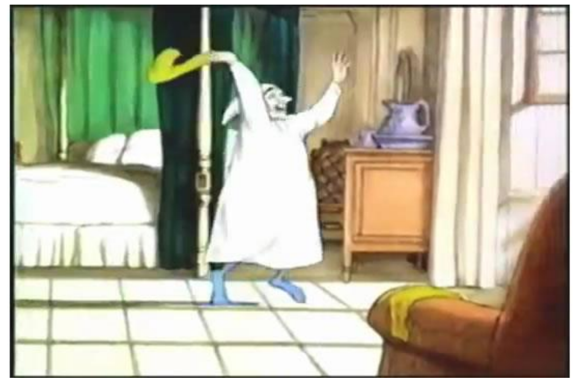
The next day Scrooge awoke to a sun-filled room. He was absolutely giddy. He had not missed Christmas. And he could still change his life for the better.